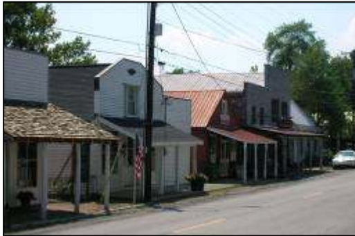
Merchant's Row - Perryville

include New Haven, Magnolia, Buffalo, Bradfordsville, Perryville, Bloomfield, Salvisa and McAfee.